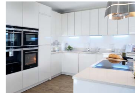
View from Plot 281